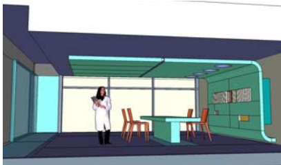
fig. 1: AWE concept - SLEEPING

This dramatic shift in the nature, place and organization of working life motivates our research which, in the simplest of terms, involves the designing, prototyping, demonstrating and evaluating of a prototypical “robot-room” with embedded Information Technologies that we call an “Animated Work Environment” [AWE] (figures 1 and 2).